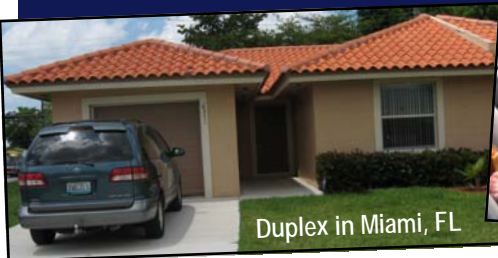
Duplex in Miami, FL